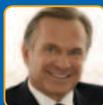
Andrew P. Ordon, M.D., F.A.C.S. Plastic Surgeon Host of CBS talk show THE Doctors Beverly Hills and Rancho Mirage, CA, USA